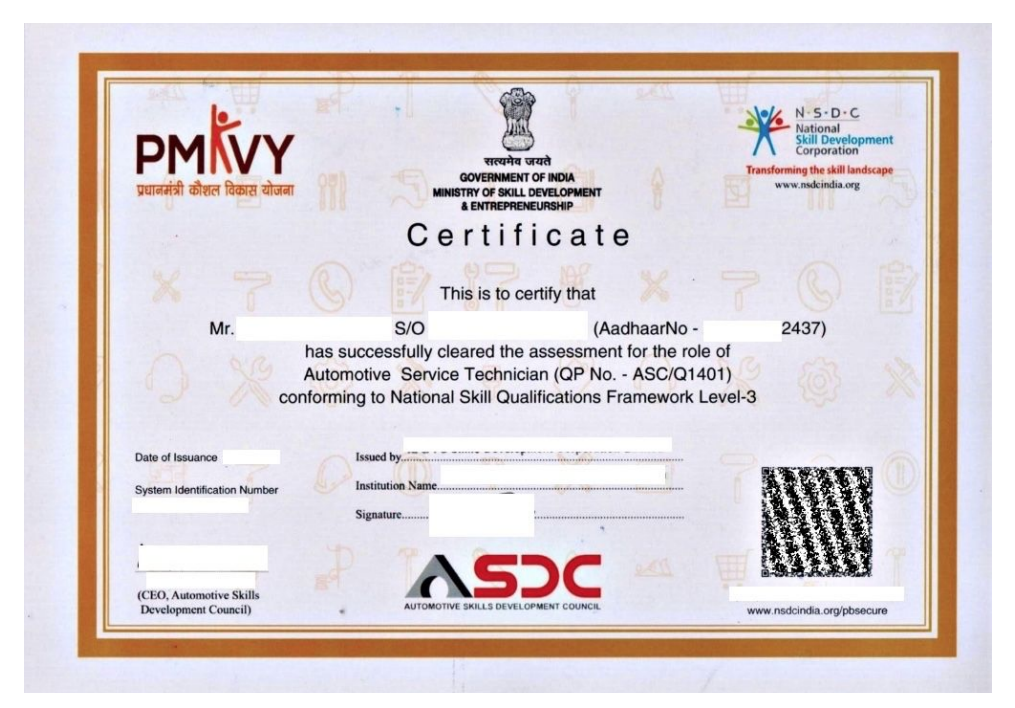
Fig 4 : Sample Course Completion Certificate

This example details the data added to a certificate for completion of a course which aligns to more than one academic standard. The BadgeClass contains details of the alignments to the target standards. The evidence for the certificate is represented in the form of the grade received for the course. While this example includes evidence aligned to one QP of the NSQF framework, the issuer is free to include multiple such items which detail the recipient's performance across multiple QPs if such granularity is so desired.