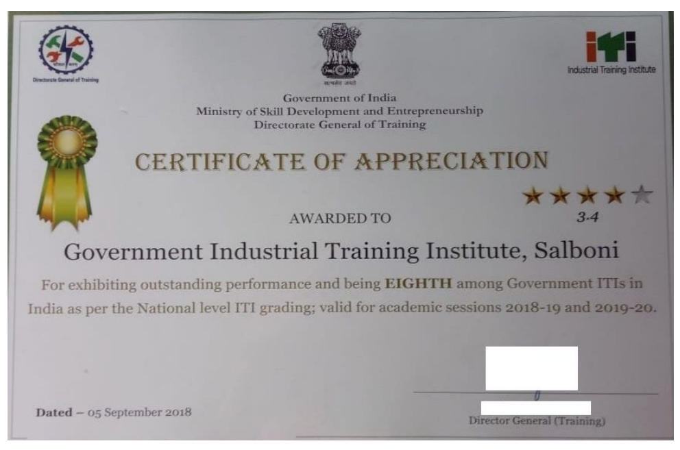
Fig 6: Sample Certificate of Merit/Rank/Appreciation